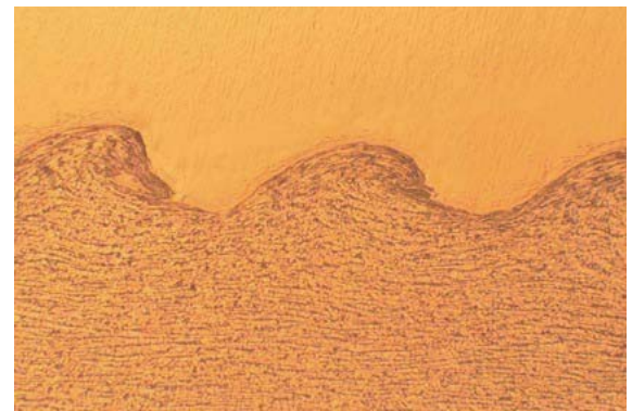
Photomicrograph of a typical explosion weld